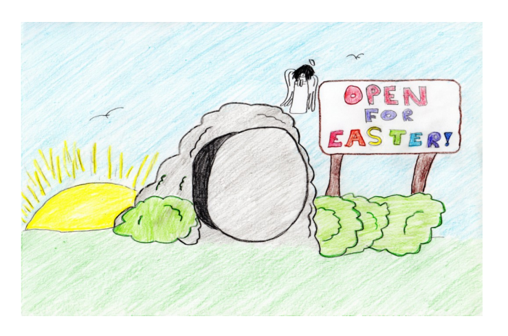
Easter for Kids 2013 Saturday, March 23 @ 1pm